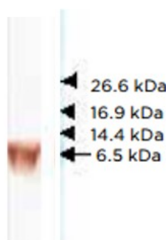
ARG10609 anti-BNP antibody [24C5] WB image

Western blot: Human synthetic BNP stained with ARG10609 anti-BNP antibody [24C5].