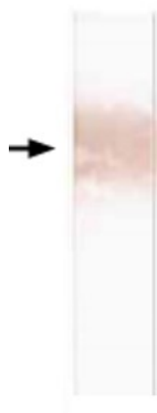
ARG10609 anti-BNP antibody [24C5] WB image

Western blot: Recombinant proBNP (E. coli expressed) stained with ARG10609 anti-BNP antibody [24C5].