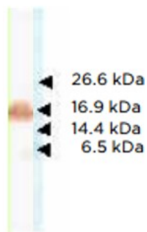
ARG10609 anti-BNP antibody [24C5] WB image

Stability studies: Recombinant glycosylated proBNP (from mammalian cell line) (green) and endogenous proBNP, purified from pooled HF patients plasma (red) were reconstituted in pooled normal human EDTA-plasma and incubated at RT for different time periods. Immunological activity was measured by immunoassay, utilizing ARG10146 anti-BNP antibody [50E1] as capture and ARG10609 anti-BNP antibody [24C5] as detection.