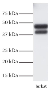
ARG22343 anti-CD262 / TRAIL R2 antibody WB image

Immunofluorescence: Human hepatocellular carcinoma cell line HepG2 stained with Rabbit IgG isotype control (left) and ARG22343 anti-CD262 / TRAIL R2 antibody (right) followed by ARG21782 Donkey anti-Rabbit IgG (H+L) antibody (Biotin) (pre-adsorbed), Streptavidin (Cy3) and DAPI.