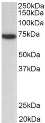
ARG65322 anti-ZAP70 antibody WB image

Western Blot: Jurkat lysate (35 µg protein in RIPA buffer) stained with ARG65322 anti-Zap70 antibody at 0.3 µg/ml dilution.