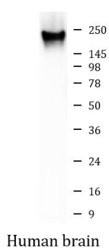
ARG55971 anti-Neurofilament NF-H antibody [RT97] WB image

Immunohistochemistry: Cerebellum stained with ARG55971 anti-Neurofilament NF-H antibody [RT97].