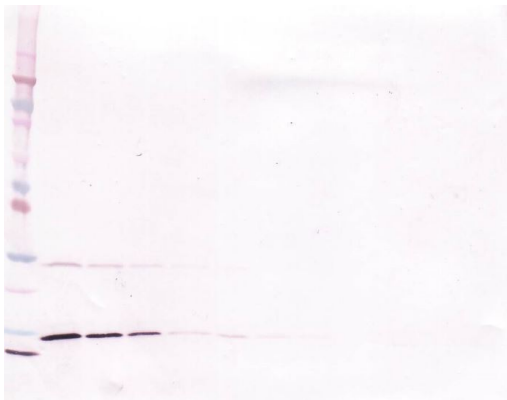
ARG56459 anti-IFN gamma antibody WB image

Western blot: 250 - 0.24 ng (left to right) of recombinant Mouse IFN gamma stained with ARG56459 anti-IFN gamma antibody under reducing condition.