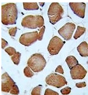
ARG59372 anti-ANGPTL4 antibody IHC-P image

Immunohistochemistry: Formalin-fixed and paraffin-embedded Human skeletal muscle stained with ARG59372 anti-ANGPTL4 antibody.